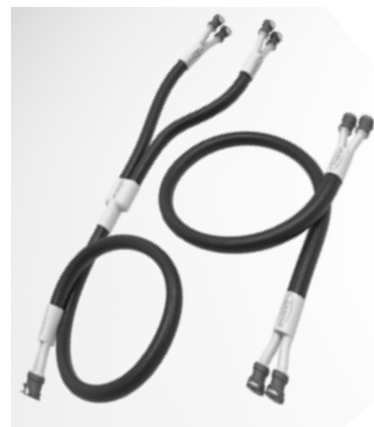
Insulated pipes with No Leak connectors

The hi-tech fabric maintains the wrap's flexibility and softness even when used at with sub-zero temperatures, as applied during the acute stage, so avoiding the burning from cold. Through the Zamar wraps it is possible to apply a pressure, alternating or continuous, programmable from the control panel for an important lymphatic function. Specific wraps are available each body part : shoulder, elbow, hand, wrist, abdomen, face, thorax-breast, hip, thigh, knee and ankle. Zamar's continual work with Hospitals and specialists enables continuous developments and improvement with new wraps .